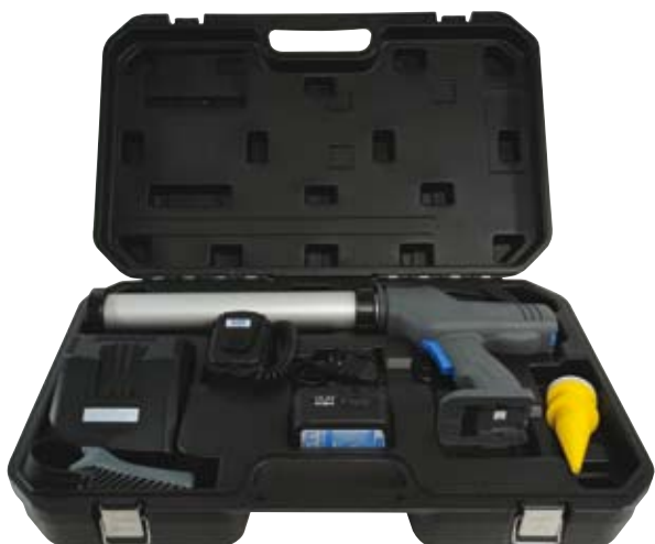
Optional battery belt clip to reduce arm fatigue and increase productivity