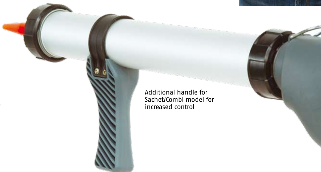
Additional handle for Sachet/Combi model for increased control