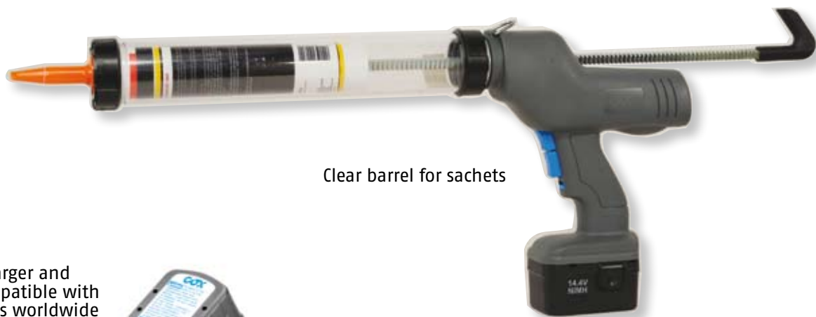
Clear barrel for sachets