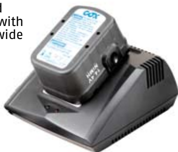
Additional charger and batteries. Compatible with power supplies worldwide